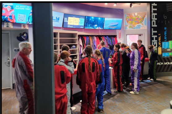
STEM Club members in their flight suits.

area and velocity. The students measured and recorded data in trying to predict how fast they needed to turn up the wind in order to get the item to fly. The final portion of their day was a parachute competition back in the lab. The students really enjoyed all of the different activities making this a very successful field trip!