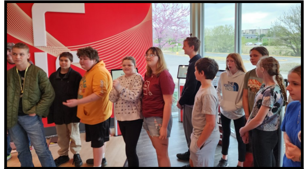
STEM Club members at the beginning of their field trip.